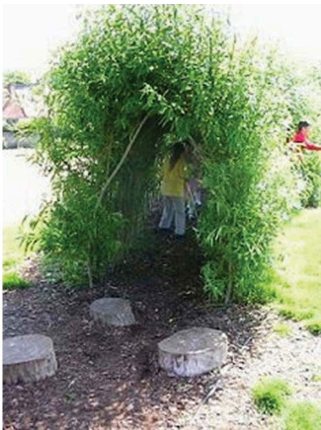
Figure 2. Willow Arches.

outdoor classrooms. Relevant to this paper, a CAP was formed with each of the local schools after I was approached by several school parents familiar with the project, asking whether my undergraduate university students and I could install an outdoor classroom at their children's schoolyards.